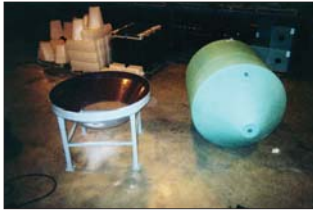
CONE BOTTOM TANKS