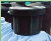
TANK RISERS FOR SURFACE ACCESS