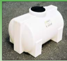
HORIZONTAL LEG TANKS