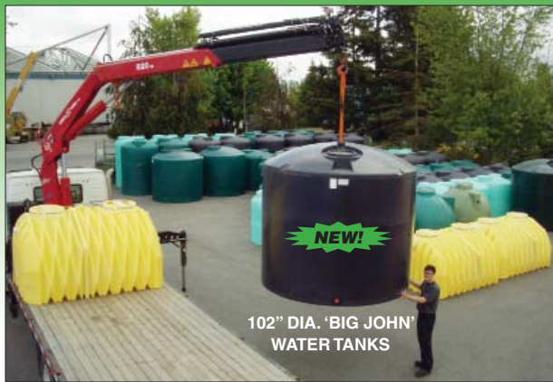
102" DIA. 'BIG JOHN' WATER TANKS