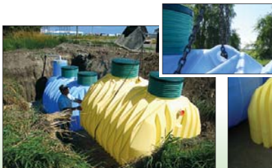
SEPTIC / WATER 'SUPERTANKS' CAN BACKFILL DRY AND FREESTAND